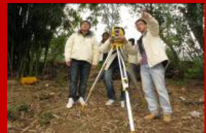
The project team conducted a site survey in Jan 09.