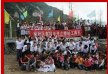
The bridge was accomplished on 11 Apr 09.