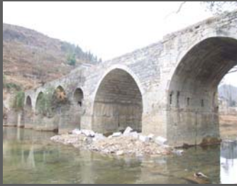
The project team targets to complete all necessary works in