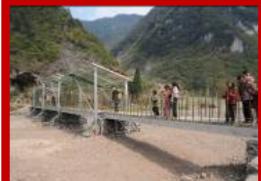
Wu Zhi Qiao at Fangmaba Village

More information for the project in Shaodi Village can be found here .