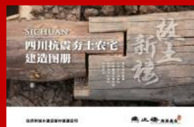
Anti-seismic Rammed-earth Village House DIY Construction Manual