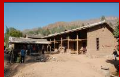
New houses built by the villagers who adopted our green building method.