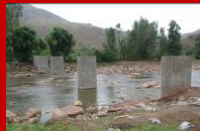
The foundation works of Wu Zhi Qiao at Maan Village were completed in Jun 09.