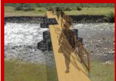
The project team targets to complete a new bridge for Shaodi Village on 8 Aug 09.